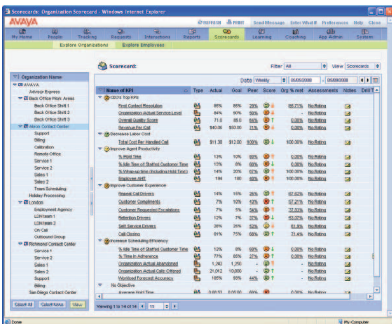
Figure 1. Quality Monitoring Scorecard

Quality Monitoring – By adding Quality Monitoring to Contact Recording, businesses will have an integrated application that allows supervisors to monitor complete interactions and score agents on their performance. Avaya Quality Monitoring captures the on-screen activity of agents, such as data entry, screen navigation and data retrieval, and synchronizes it with the voice recording captured by Contact Recording. During replay, this provides a complete and comprehensive view of the customer